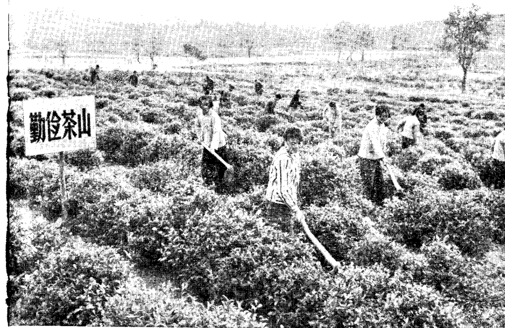
Success out of failure. Chinchien Brigade used Chairman Mao's philosophic thinking, summed up experience, and planted tea shrubs on virgin hill slopes where peach and tung oil trees had not done well.

Thus after lively discussion the cadres arrived at a clear understanding of what's to be learned from Tachai, and they decided that Chinchien Brigade should keep on