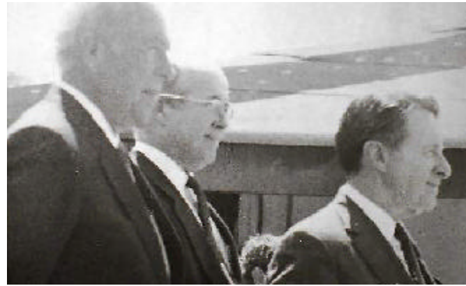
Poindexter (center) with Schultz (left) and Weinberger (right) in the Reagan days.

Anyone who thinks the U$. government doesn't spy on its citizens has their head in the sand. The creation of the Information Awareness Office is just a more open opportunity for the government to gather intelligence now that it has created sufficient fear in the American public to allow for violation of even the most basic of civil rights. Activists in particular should be careful about their e-mail and phone conversations. Always assume the government is listening and give them as little information as possible.