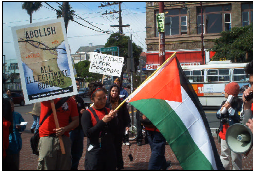
Activists from RAIL and BAYAN contingents meet up in the mission district.

Some MIM and RAIL comrades also participated in a feeder march organized by BAYAN-International USA, a national democratic organization of Filipino sojourners. This march was quite boistrous; the chant leaders did a good job pumping up the crowd and writing hip, original chants (a nice break from the "One two three four..." and "Hey hey ho ho..." standards). The chants were on target politically as well. They included "Stop the U.S. war machine, from Afghanistan to the Philippines" and "Bush, you fascist, don't think you can outlast us!"