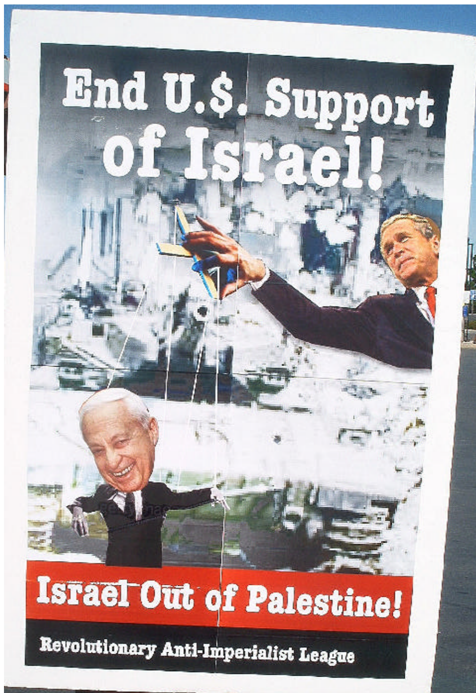
This RAIL poster met with widespread approval at the march in San Francisco (see story page 1).

Note: http://www.usatoday.com/usatonline/20020409/4009119s.htm