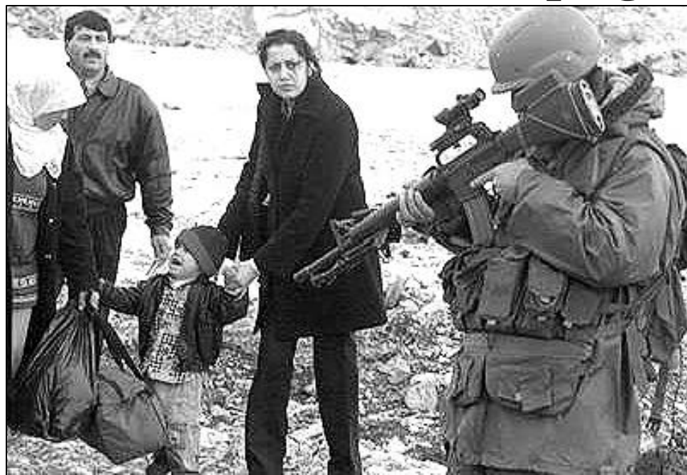
Hey, soldier, where'dya get that gun? The University of California invests in the Israeli war machine to the tune of billions of dollars.

The campaign calls on the UC system to investigate the companies it invests in and does business with for ties to the Israeli apartheid state and divest from those companies with large investments in Israel — especially those involved with the Israeli military. This divestment should continue at least as long as Israel refuses to withdraw from the territory it occupied in 1967.