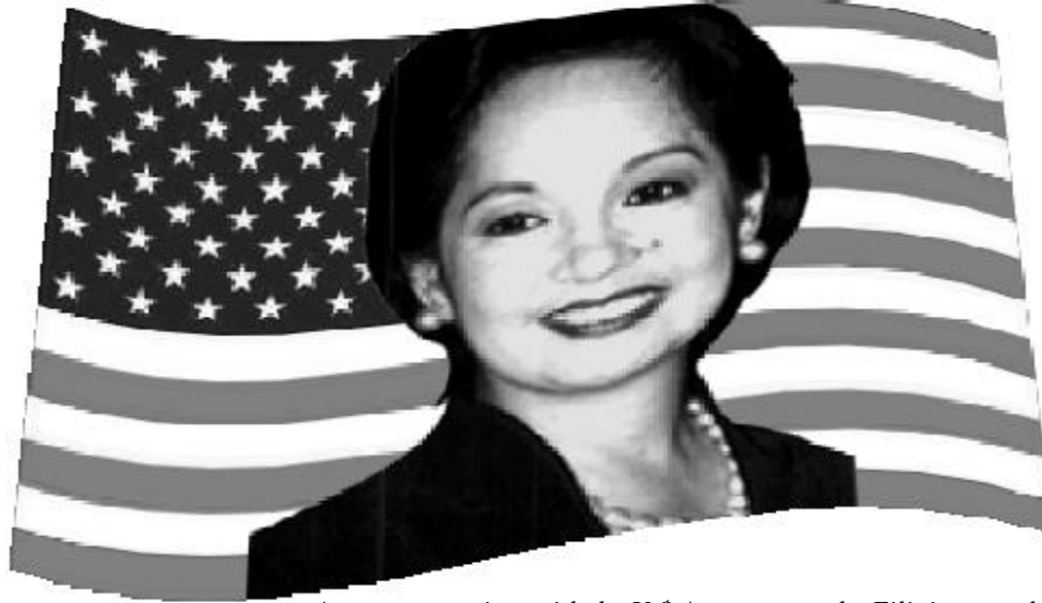
Arroyo conspires with the U$.A to oppress the Filipino people.

"The number of political prisoners increased to 350 under the U.S.-Arroyo regime in less that two years from 150 under the U.S.-Estrada regime. Summary executions, massacres, tortures and illegal arrests also increased. An example