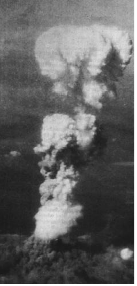
The atomic bomb dropped on Hiroshima.

MIM will do its best to expand its influence within U.$. borders in a last ditch effort to avoid what is probably inevitable. Those who see the weaknesses of Amerikkans should see to it that MIM