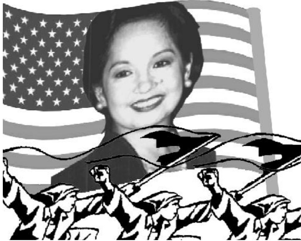
The revolutionary forces are aligned against Arroyo and her Amerikan puppet-masters.