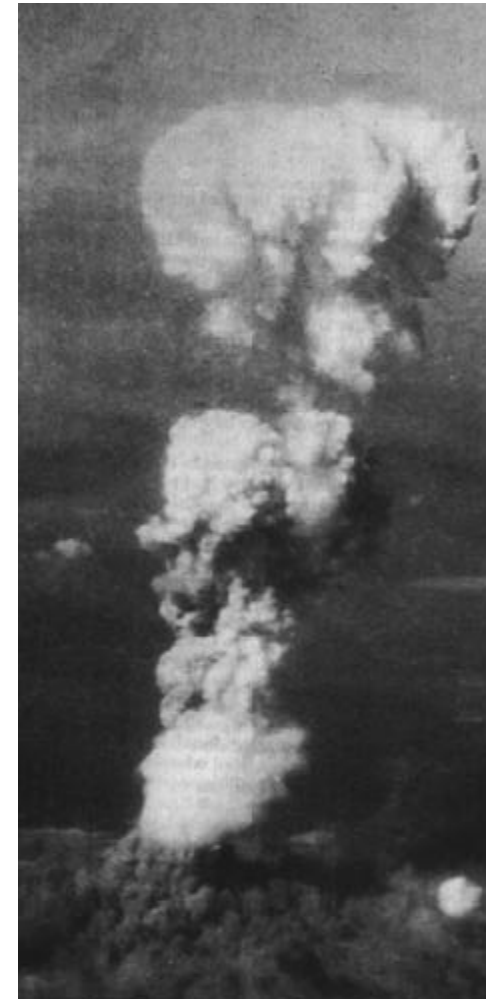
The atomic bomb dropped on Hiroshima.

MIM will do its best to expand its influence within U.S. borders in a last ditch effort to avoid what is probably inevitable. Those who see the weaknesses of Amerikkkans should see to it that MIM gets financial support to expand. Even those who focus on more “moderate” activities should realize that changing Amerikkkan public opinion is a multi-faceted task, and what is most lacking is the determined, uncompromising but highly visible presence of MIM in favor of the global rights of nations to self-determination. Without MIM to blaze the way, there is no one who is able to look “moderate” in the current state of Amerikkkan opinion. The proletariat must play its leading role to untwist the minds of the Amerikkkan public so that the Amerikkkan population can get along with the rest of the world.