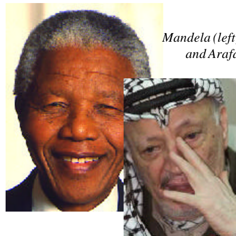
Mandela (left), and Arafat

MIM responds: Your comments on Mandela and Arafat are very well taken. Fifteen years ago, the movements they