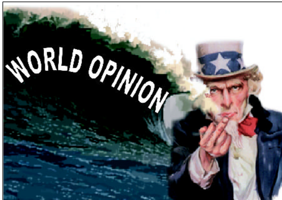
Unkle $cam proves once again he can't learn from his mistakes.

Thus, the whole conflict that English and Amerikkkan rulers see revolves around weapons proliferation. In a capitalist world where it is profitable to