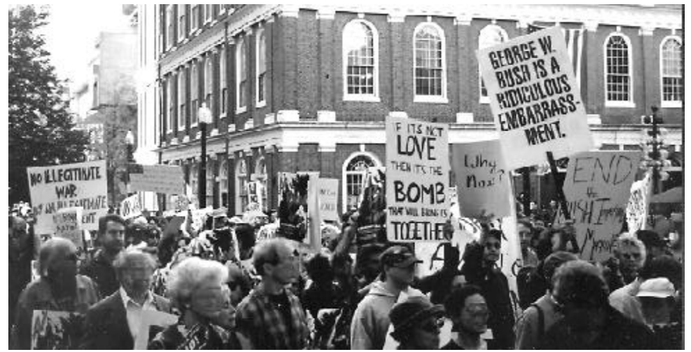
The Boston rally.

At the rally in San Francisco the crowd cheered Senator Barbara Boxer the loudest, with chants of "Barbara, Barbara..." A democrat, Boxer voted against the