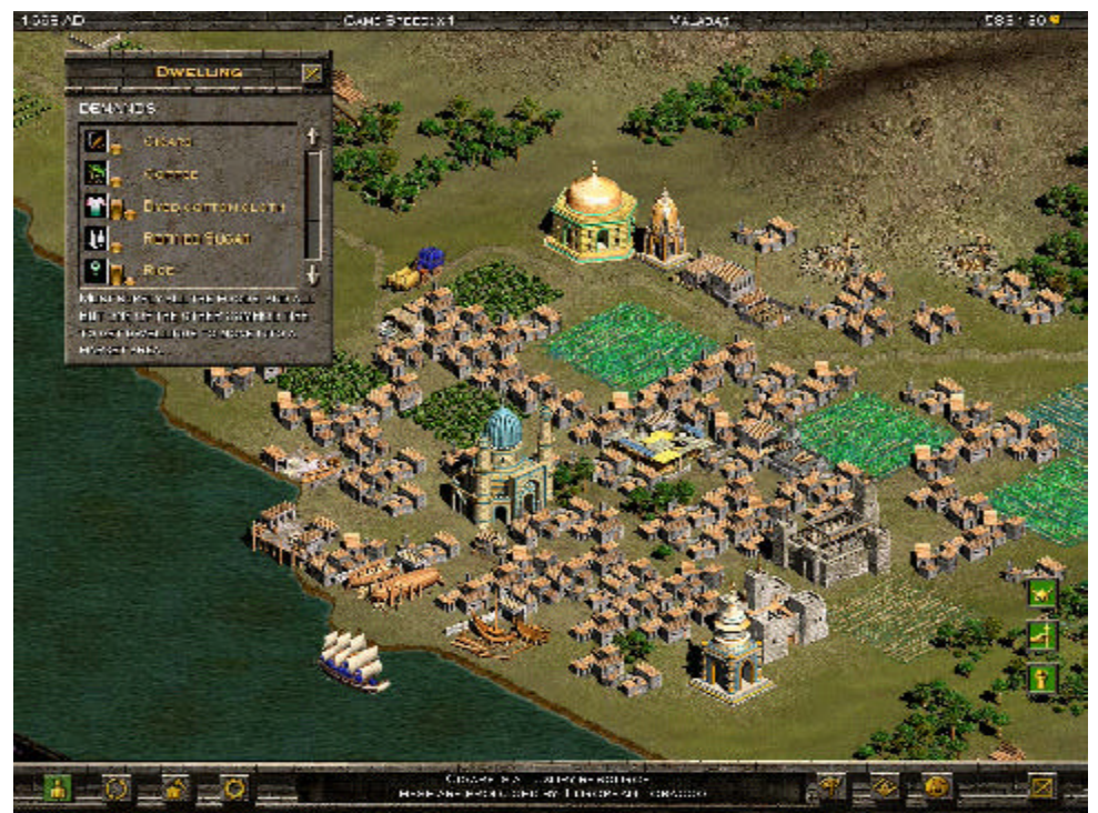
“I don’t know what rice is, I just know its price.” “Trade Empires” interface guides players’ quest for personal wealth.

made is that we see that some goods will go to waste, simply because there is no demand even at half off the original price. In fairness to Eidos Interactive, the difference between a sale price and total waste is merely a question of proportions. Wasting more goods may result in higher prices for the remaining goods after all.