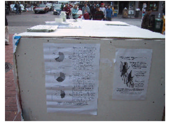
Getting the word out in Berkeley.

In a classic example of the influence of knowing someone in prison, a MIM activist talked to two young white men about the issue. One of them said that everyone in prison is no good and a criminal and deserves to suffer. The other one said to him "hey, my dad's in prison" and eagerly signed the petition proclaiming how much he would hate to be locked in the SHU. He then convinced his friend to sign as well. At the rate imprisonment is rising in the U.S., the number of people who have been or know someone in prison is reaching far into the population. And this provides a significant base of