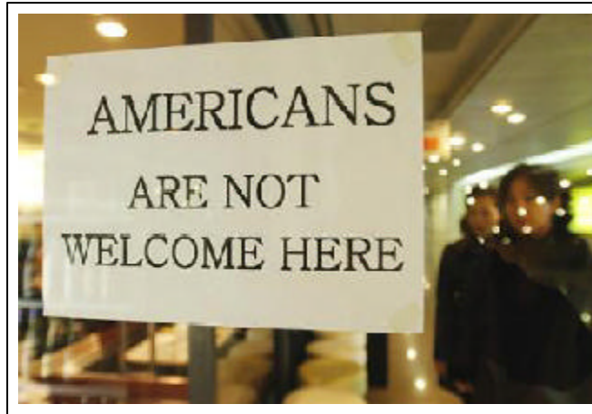
No galbi sweet ribs for G.I. Joe. Some restaurants in Seoul closed their doors to Amerikans.

MIM has nothing against the south Korean protestors carrying out some ad