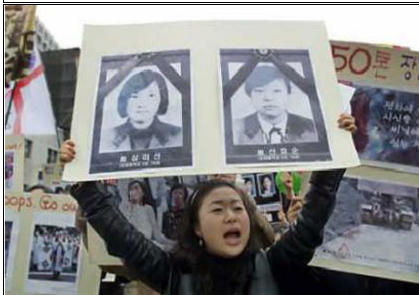
Some protestors carried photos of the two dead girls in mourning. Others burned effigies of U.S. President Bush.