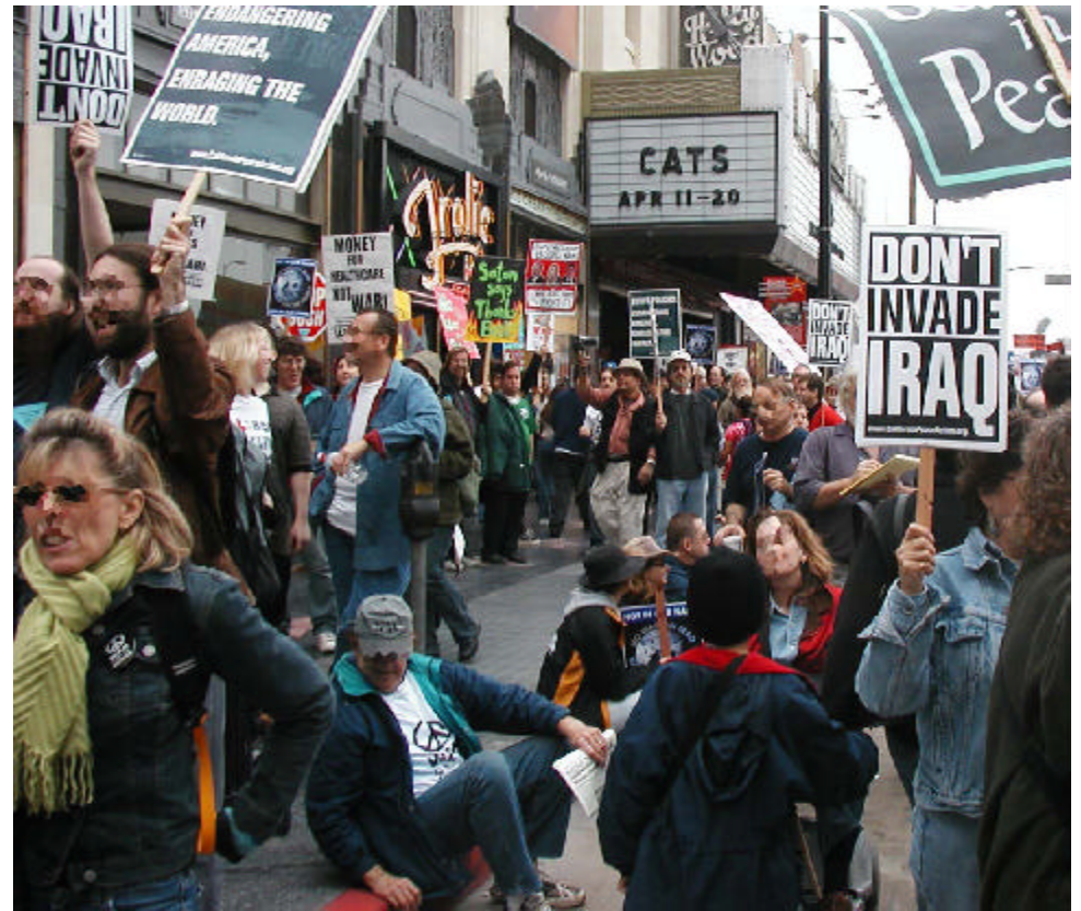
The crowd mills around before the L.A. March.

Anti-war protesters should be especially wary of the myth of the exclusive democracy of the Israeli state as Amerika prepares for war in Iraq. The U.S. has every intention of installing a quisling regime in the place of Saddam Hussein, and of supporting this regime with a