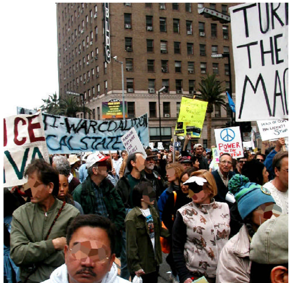
Students were among those protesting the war in L.A. on February 15; see banner from Cal State L.A..

justify the war. They will invoke overwhelming military force. It is extremely unlikely that anyone in the U.N. will oppose the United States—people throughout the world fear the United States and the United States wants it this way.