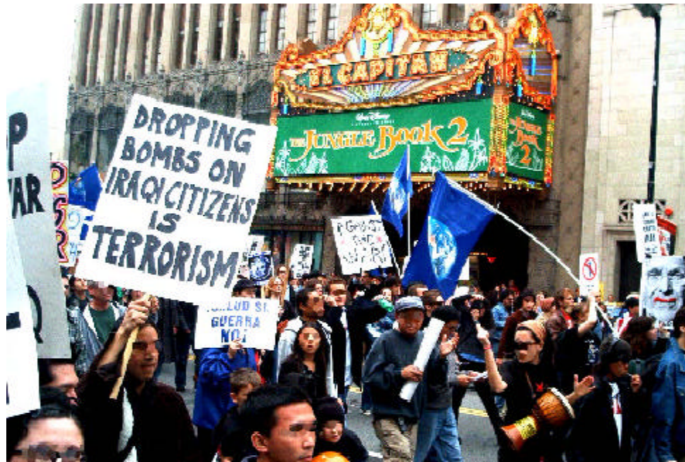
The L.A. march.