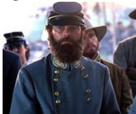
Another Amerikan lunatic: Jackson.

Stonewall Jackson—a raving superstitious loon—is “Gods and Generals” central character. He is a