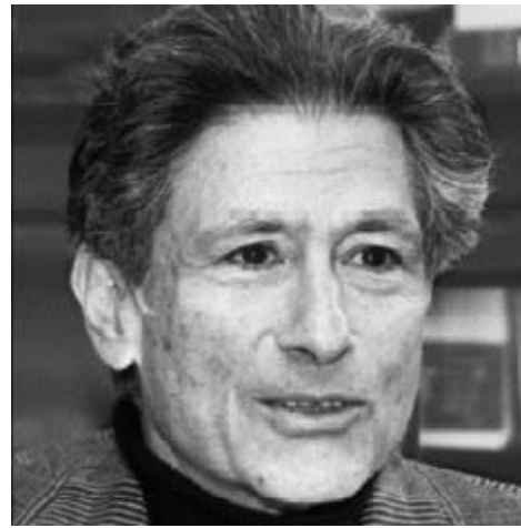
Palestinians' humyn rights.

Said blasted the tired I$raeli tactic of justifying I$rael's crimes against Palestinians by invoking past injustices against Jews and making it seem as if I$raelis are the victims. He said that humyn rights violations occur in proportion to the military capacity of the belligerent parties and that the vast inequity in economic and military power between I$raelis and Palestinians is reflected in the scale of I$rael's violations of