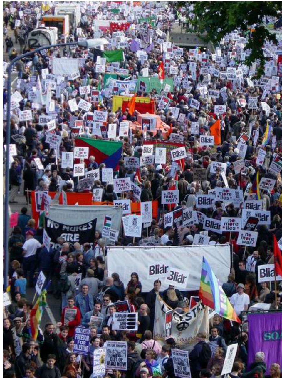
London demonstration, September 27 2003.

Of course, it is true that the English people had no preparation for armed struggle while Iraqis did. The fact remains that had the English wanted an