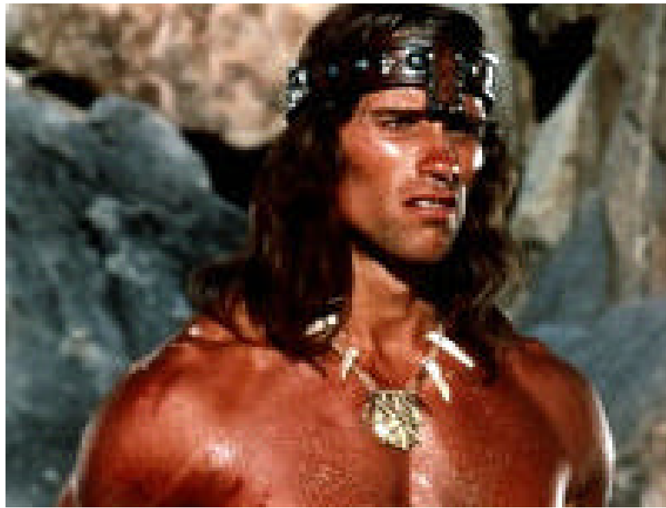
The next governor of California.

Outside of a promise to lower “the car tax”—which will likely be difficult to implement(2)—Schwarzenegger studiously avoided saying anything of substance during the campaign, relying instead on clichés about “puke politics,” “biased media,” etc., posing as Hercules poised to clean out the Augean stables of Sacramento. After he won the election, Arnold appointed a transition team that