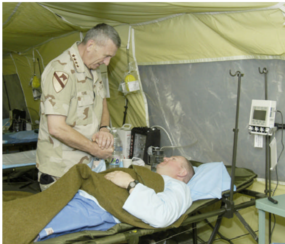
As Amerikan casualties mount, U$. Commander Tommy Franks visits a wounded G.I who took one for the home(wrecking) team..