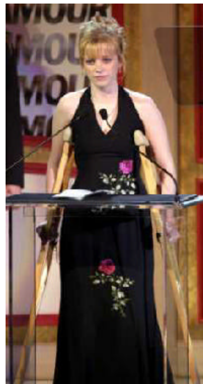
Jessica Lynch's book, and her accepting an award from Glamour magazine.