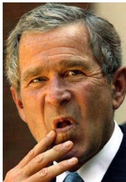
George W. Bush