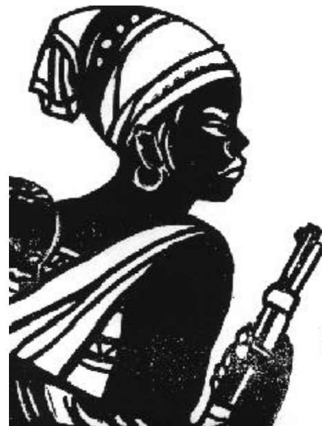
The oppressed must meet the violence of the oppressors with violence as a matter of self-defense.

MIM is not philosophically opposed to violence. Arguments about violence must come with evidence of their comparative effectiveness in the real world or be guilty of siding with the violence of the status quo. Typically middle-class critics of Maoism with humyn-rights illusions cannot name any place concretely