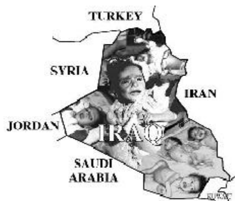
Where on the news do we hear about the effects of US sanctions on the Iraqis?

I do not want to beat this in the head, but the other day a group of us was discussing how the World Bank subsidized the $87 billion Bush said was needed to support the troops and finance "rebuilding" in Iraq for the next six to eight months. Even though the news conveyed that information, it failed to explain how the World Bank functions and what this World Bank subsidy means for the Iraqi people. A viewer may possess some information but not enough to process and