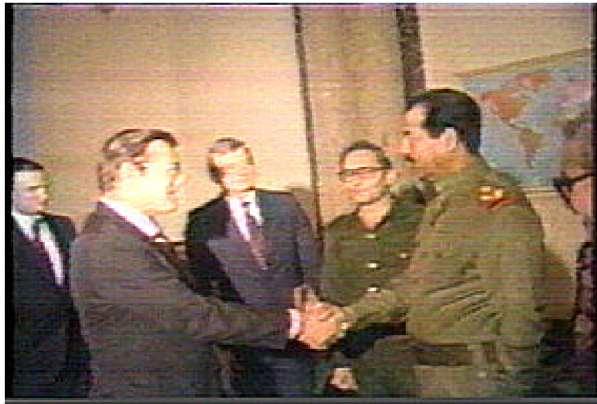
Donald Rumsfeld (the U.S. Secretary of Defense in 2003) shaking hands with President Saddam Hussein, December 20, 1983.

9. President Ronald Reagan sent Rumsfeld to meet with Saddam Hussein