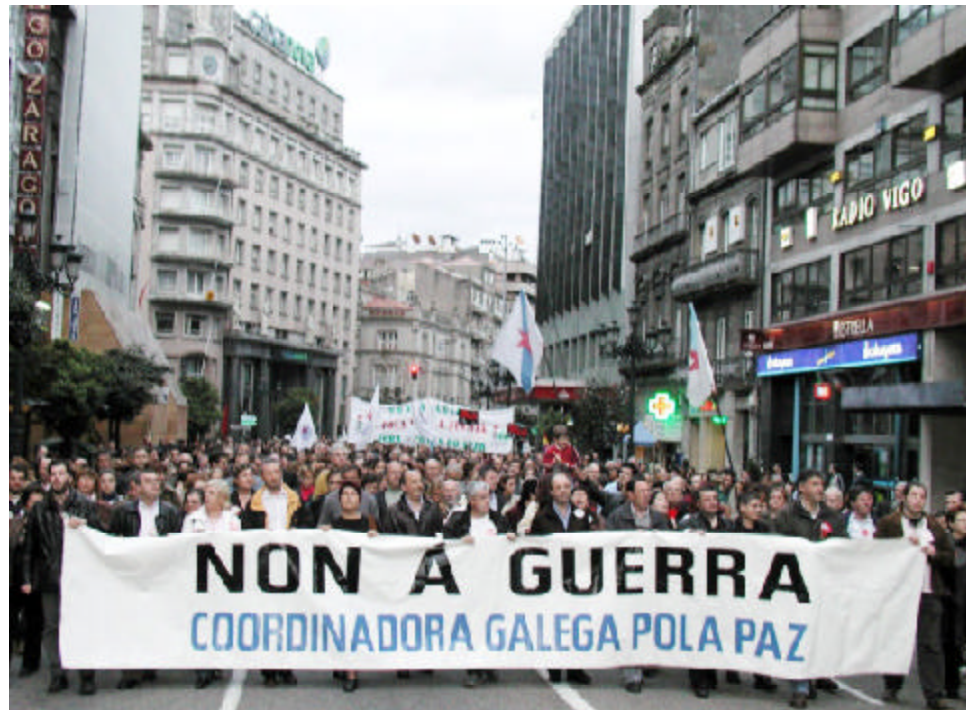
Spanish peace protestors