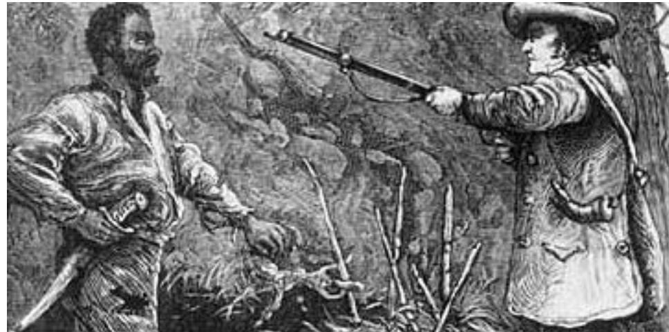
Nat Turner: Now that's a revolutionary hero.

We'd agree with you that Black resistance to slavery was principal to slavery's overthrow. Lincoln did not free the slaves; slavery was overthrown in a revolutionary process, the largest part in which was played by Blacks, especially in the electoral and armed struggles of Reconstruction. The failure of Reconstruction and the counter-revolution that followed has a lot to do with the fact