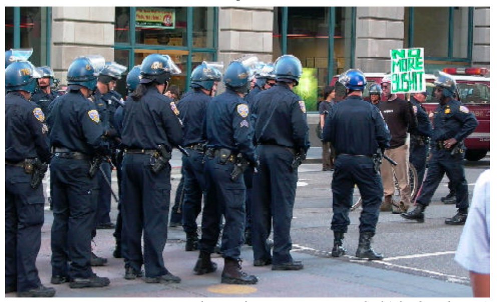
Police confront protesters at Bechtel.

Although there was no significant showing from the Black community, it was interesting to note a consistent difference between those in attendance and some of the white participants. When one man was chanting at the police about