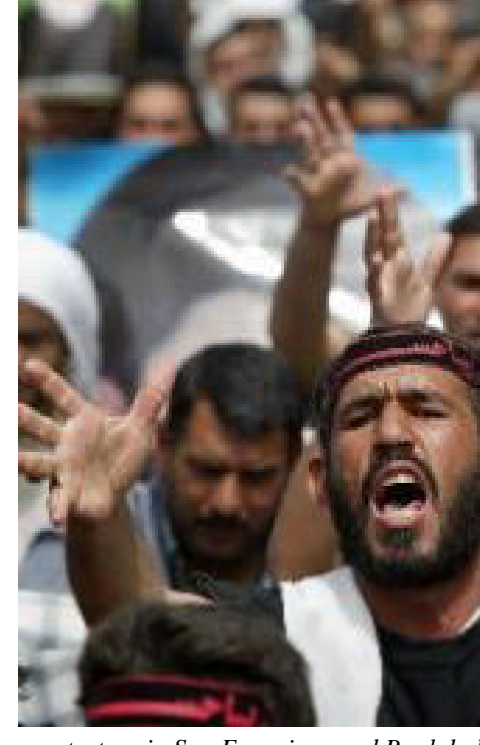
Anti-war protestors in San Francisco and Baghdad.

many months since the militant outrage of the people shut down the streets of San Francisco last year. But this large rally showed that many people are still paying attention and speaking out against Amerikan imperialism.