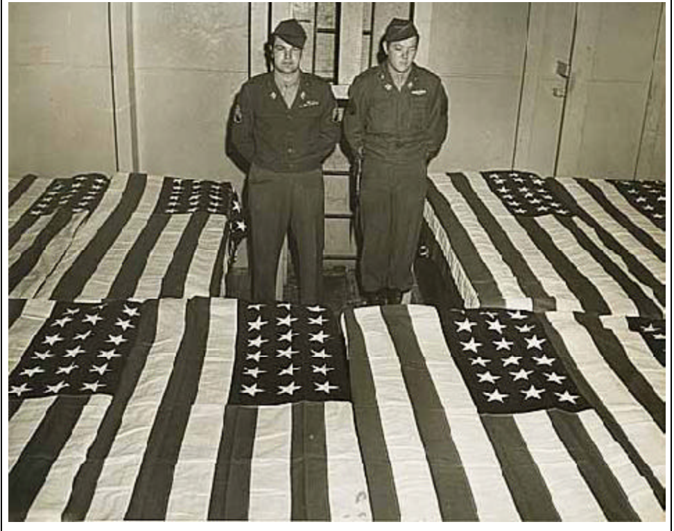
Dead Amerikans cause a pause for reflection.