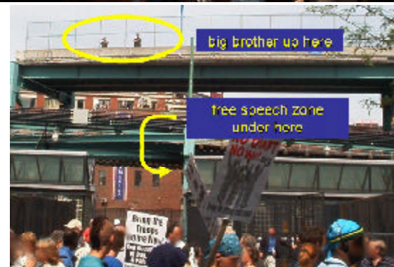
The "protest pen."