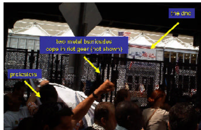
Barriers to keep protesters from the site of the DNC

links thoroughly. That would be in the best interests of the Iraqi and Afghan peoples and be sign of true sovereignty. We are skeptical that either tribunal will uncover full U.S. culpability in these cases, as they have been set up by U.S. puppet governments.