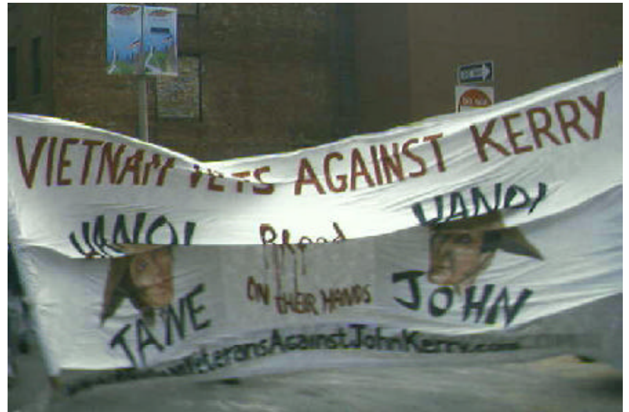
Police closely followed this protest by silent youth at the DNC (right), while ignoring the protest by Amerikan veterans against Kerry (above).