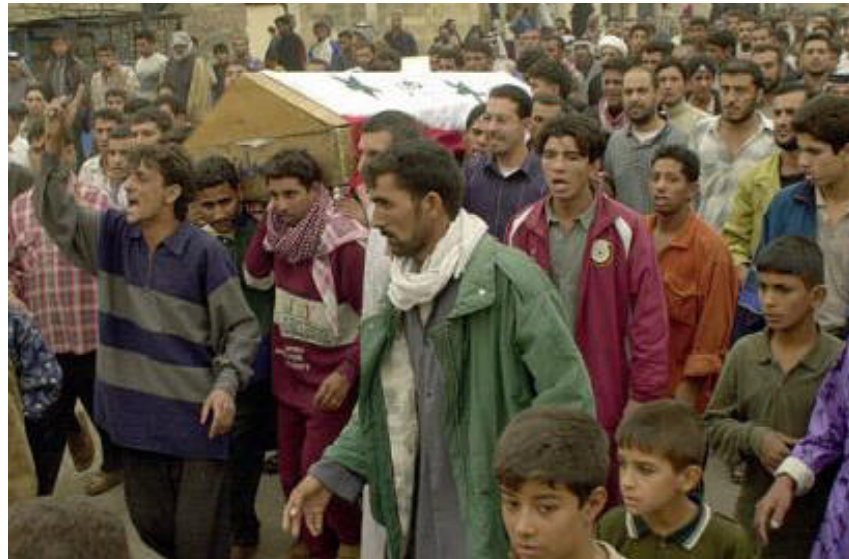
Protesters carry hundreds of flag-draped coffins through the streets of New York (left) to symbolize the 973 American soldiers killed in Iraq (as of 29 Aug 04). If they had carried one per every Iraqi civilian killed, like the one above, the line of coffins would have been more than ten times as long. Hundreds of thousands marched against the Republican National Convention just as MIM Notes went to press. For more coverage of the RND and DNC protests, visit http://www.etext.org/Politics/MIM/elections/ and http://www.etext.org/Politics/MIM/whatsnew.html .