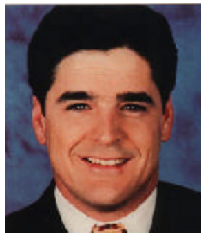
Sean Hannity, radio host snake.

Here we go again with Sean Hannity and his so-called smooth right-wing radio host snakes! To the perceptive man, their lies are so lame! So who believes them? Well, unfortunately there are numerous uneducated Americans who are easily duped by their lying propaganda! I feel for them. They are comparing Nick Berg's beheading with the U.S. soldiers who abused those prisoners at the Abu Ghraib prison.