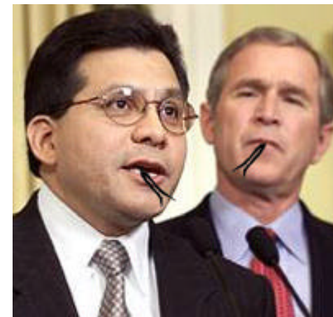
Gonzales: 'Can't control' outsourced torturers.