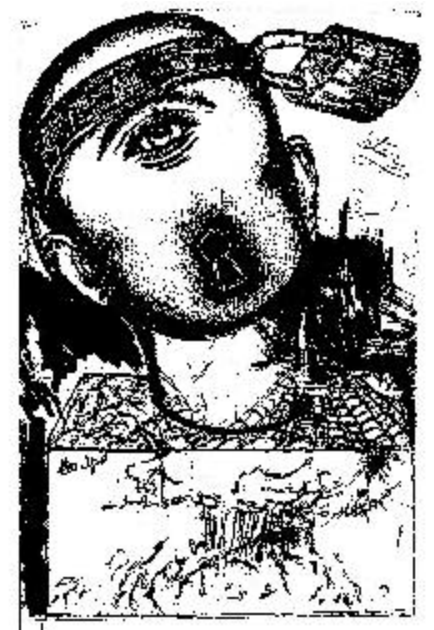
We must strive to unbind the winds of the people by liberating the earth.

Knowing the world and conditions inside the belly of the beast is key. Equip yourself with mimnotes.info and write for mimnotes.info.