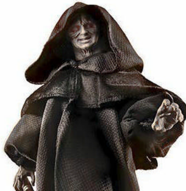
Darth Sidious: Another world's Dr. Frist?

The story of Anakin's transformation into Darth Vader can be simplified even further. Hotheaded Anakin represents an intermediate between the Force, most embodied in the Jedi Council, and the