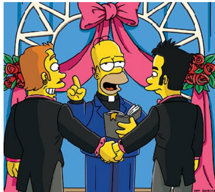
Action hero Schwarzenegger lags behind cartoon bufoon Homer Simpson in his support for gay marriage.