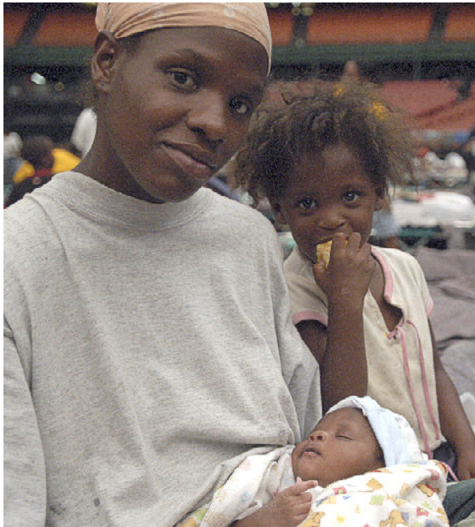
Don't have to live like a 'refugee'?