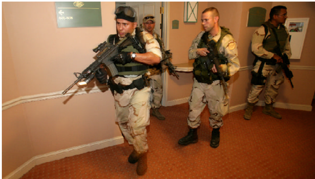
Thank you, Homeland Security! This photo from the DHS website was captioned “Customs and Border Patrol Supports Relief Effort: CBP officers search an apartment building room by room in downtown New Orleans.”

6. “Another Civilian Group Starts Patrolling U.S.-Mexico Border,” 16 September 2005, http://www.nbcsandiego.com/news/4984488/detail.html