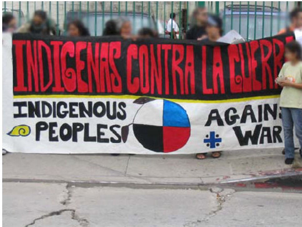
At least not everyone at the anti-war protest was blatantly pro-Amerikan.

Shortly after the march started, an ANSWER organizer speaking into a microphone at the head of the march cited a Gallup poll showing 67% of Amerikans disagreeing with Bu$h's handling of the war to prove that most Amerikans oppose the war, but this is very misleading; according to the exact same USA Today / CNN / Gallup telephone poll conducted on September 16-18, only 30% of adult Amerikans tended to agree with withdrawing all troops.(1) And some of those who didn't approve of Bu$h's handling of the "situation in Iraq" actually supported sending more troops! This kind of distortion of poll results is typical of people sowing illusions about the strength and popularity of the antiwar movement and is actually a way of saying that 37%