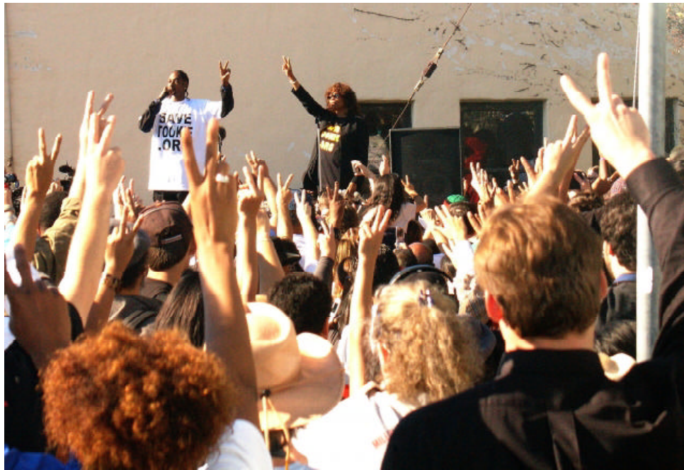
From from indybay.org.

Update: On November 30, the California Supreme Court rejected an appeal from Williams to reopen his case, leaving the appeal for clemency from Gov. Schwarzenegger as the most likely avenue for stopping the execution. The governor has a clemency hearing scheduled for Dec. 8. —ed