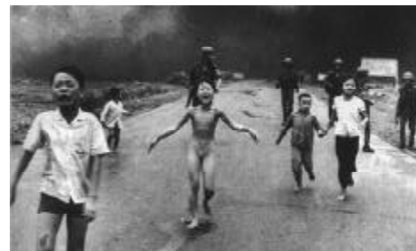
Same war, different war.

Whether or not weapons of mass destruction existed in Iraq before the U.S. invasion matters little. Imperialist aggression is wrong either way. However, the absolute lie that Iraq had weapons of mass destruction was used to justify the U.S. war of aggression. Given this fact, it is the ultimate irony that evidence is mounting that it is the Amerikkans themselves who are unleashing these weapons on whole communities in Iraq. New reports are now confirming use of chemical weapons by the United States in Iraq. The United States may have used white phosphorous shells indiscriminately against civilians during the November 2004 offensive in Falluja against Iraqi national liberation fighters and people supporting them. Earlier, the U.S. government had denied such reports as