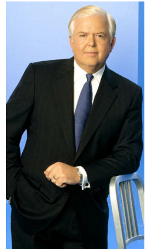
Dobbs: Someone should steal his job.

Instead of relating unemployment and educational attainment to imperialist interference in the self-determination of Latino nations inside U.S. borders, Romans described the lower high school graduation rate of Latinos as a problem for America as a whole, a political problem. "[T]here are fundamental problems in this country that are eating away the foundations of America and the numbers don't lie." Romans also gave a figure for government-defined poverty. Portraying unwed women and female youth as a threat to the "national interest," Romans reported: "today the government announced a record 1.5 million babies born to unwed mothers last year." CNN had several so-called experts talk about how these and similar numbers supposedly reflected a danger to Americans in general, oppressors and oppressed alike.