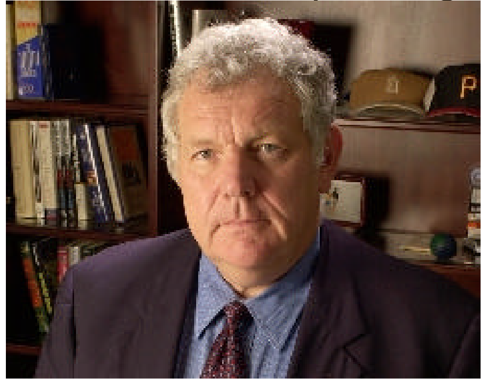
Bennett: former drug 'czar', gambling fiend, education secretary, moralist, racist

So, not only do Blacks have a higher poverty rate than whites (using the unscientific U.S. government definition's of "poverty"), poor Blacks often face harsher conditions than poor whites. Being Black or not is a relevant social variable in some contexts, and there is nothing racist or racial about pointing this out. In fact, it is an indictment of national oppression to talk about the ways that rates for different kinds of crime are shaped by national oppression. Some white people don't have to steal things on the street because they have jobs where they sit in an office stealing wealth from Third World workers, or jobs in which they put the finishing touches on products made by oppressed-nation migrants and take a cut of the profit. This doesn't just have to do with skin color or even perceptions of