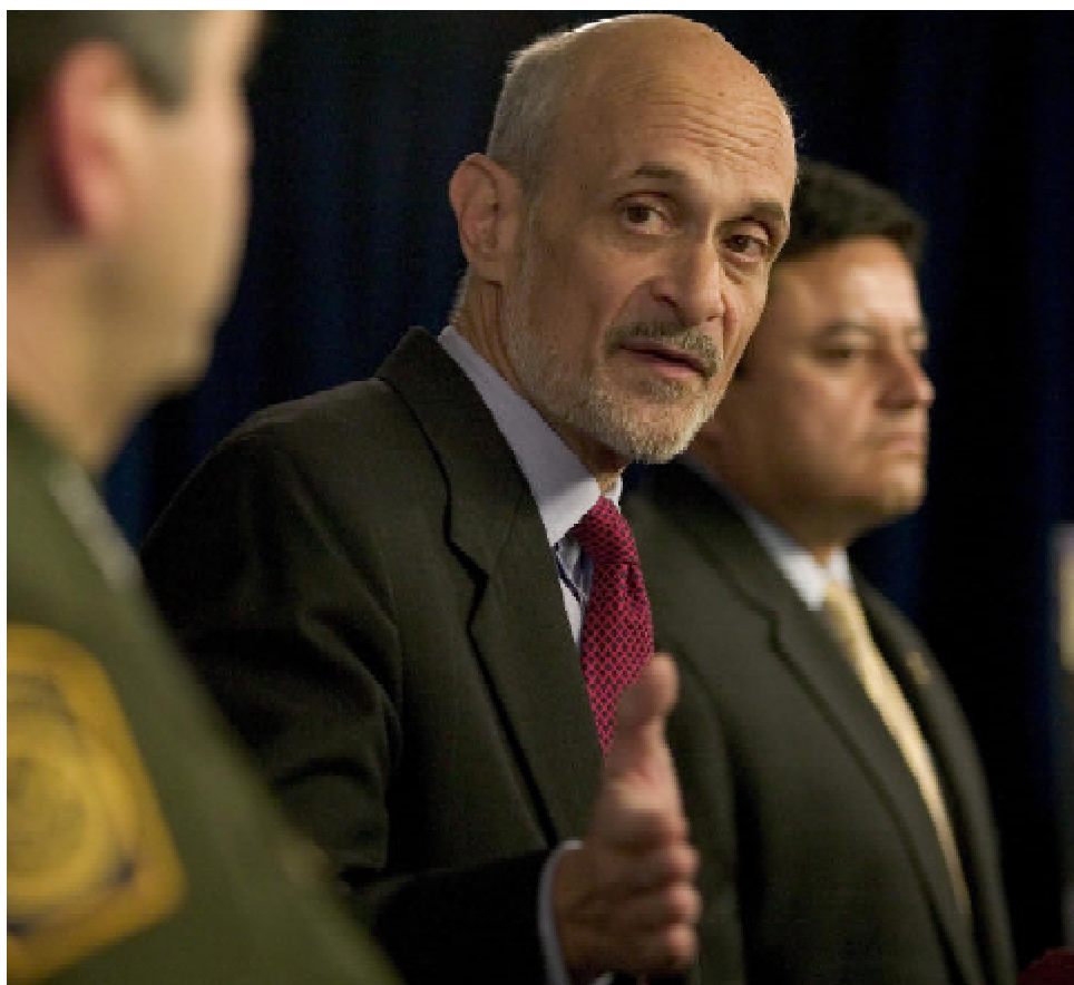
Chertoff: “There is zero tolerance for violence along the border.” But the maintaining the border is an act of violence, and the U$ is its greatest perpetrator.