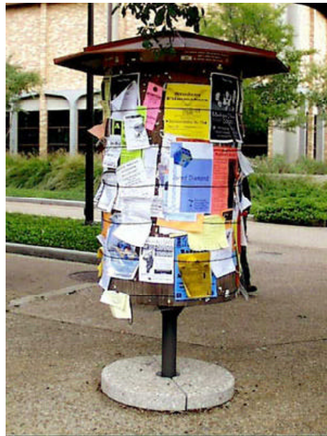
WHICH GETS YOUR GOAT? The eyesore is in the eye of the beholder (the beholder's class, that is).

"SEC. 184.65. IDENTIFICATION OF PERSONS RESPONSIBLE FOR POSTING OF SIGNS. In any civil action seeking recovery of a civil penalty and/or costs of removal of a Sign for violation of any of the provisions of this Article proof that the Sign posted contains the name of or in any other manner identifies a Person shall give rise to a rebuttable presumption that the Person caused such