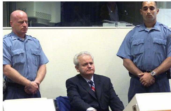
Milosevic on trial.

While scores of bodies keep turning up every day in Iraq, the New York Times of March 14th put Milosevic’s war crimes pages ahead of the deaths in Iraq. The Hague tribunal needed to have Clinton and Bush in the dock for major credibility. As it stands right now, the united States openly flaunts the Hague tribunal as an