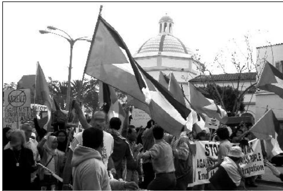
Palestinian flags blanket Westwood as the march passes near UCLA.

On the same day, U.S. Secretary of State Colin Powell called on Palestinian President Arafat to "do more to combat terrorism"— even though Israeli troops had invaded and destroyed most of his office compound the day before, cutting off electricity and phone services. As Powell well knew, Arafat couldn't have ordered a pizza, let alone carried out a complex political and military campaign against so-called "terrorists." Powell was just playing his role in a very old piece of political theater: Claim the Palestinians and/or Arab states are unwilling to negotiate in order to cover up the fact that the United States and