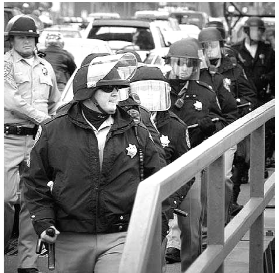
Riot police close in on marchers