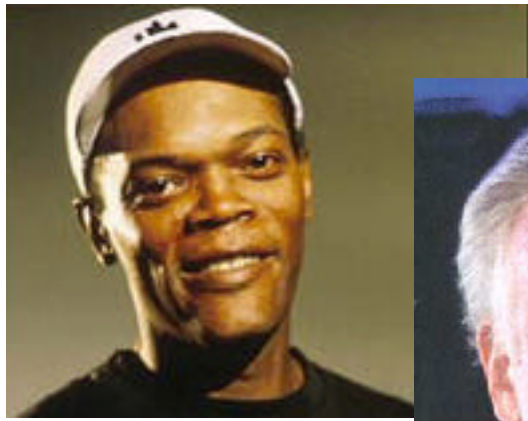
Samuel L. Jackson loses one for the Amerikan team against the Brits, led by Ian McDiarmid.

“[T]he movie is kind of a laboratory on American vs. British technique. Score: Brits 10, Yanks 0. That’s because to the Brits, who work from the outside in, acting is physical mastery of face and voice and body, strategically employed at certain moments for impact. An actor imposes himself on the character, and invents charm and wit and sparkle where none exists. So even the guy playing Palpatine (Ian McDiarmid) is creepy-elegant, and McGregor, athletic and earnest, can even bring a little life to a