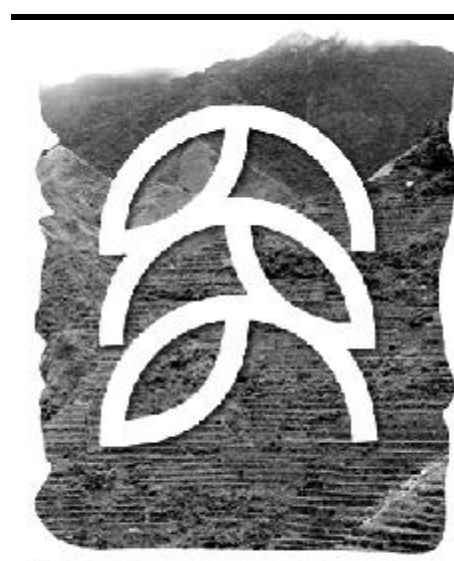
Rice Genome Project

No wonder the bourgeoisie has a hard time defeating all kinds of mystical bugaboos like creation ‘science.’