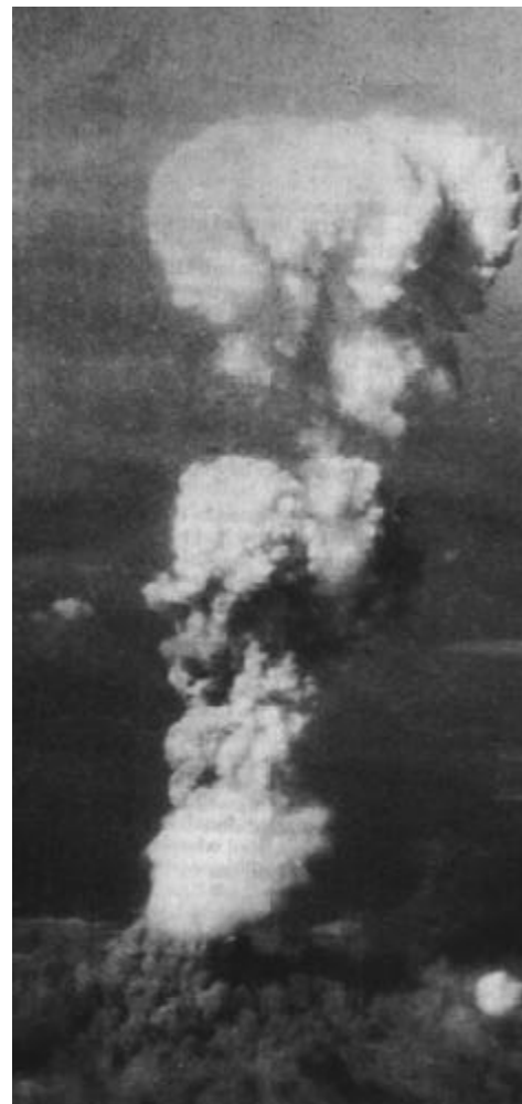
The atomic bomb dropped on Hiroshima.

MIM will do its best to expand its influence within U.S. borders in a last ditch effort to avoid what is probably inevitable. Those who see the weaknesses of Amerikkkans should see to it that MIM