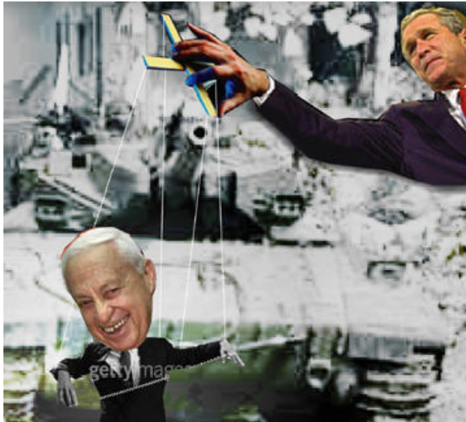
Israel, under current leader Sharon, or whomever, dances to Amerika’s tune.

In spite of having quashed anew any chance of peace, Prime Minister Ariel Sharon quickly proclaimed the air strike “one of our major successes.” I$raeli officials later backpedaled in response to international criticism, saying the army would not have made the strike had it known what the consequences would be.