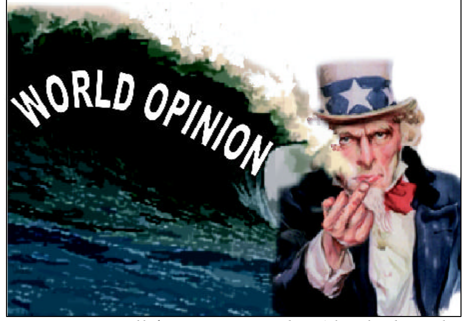
Unkle $cam proves once again he can't learn from his mistakes.

Thus, the whole conflict that English and Amerikkan rulers see revolves around weapons proliferation. In a capitalist world where it is profitable to