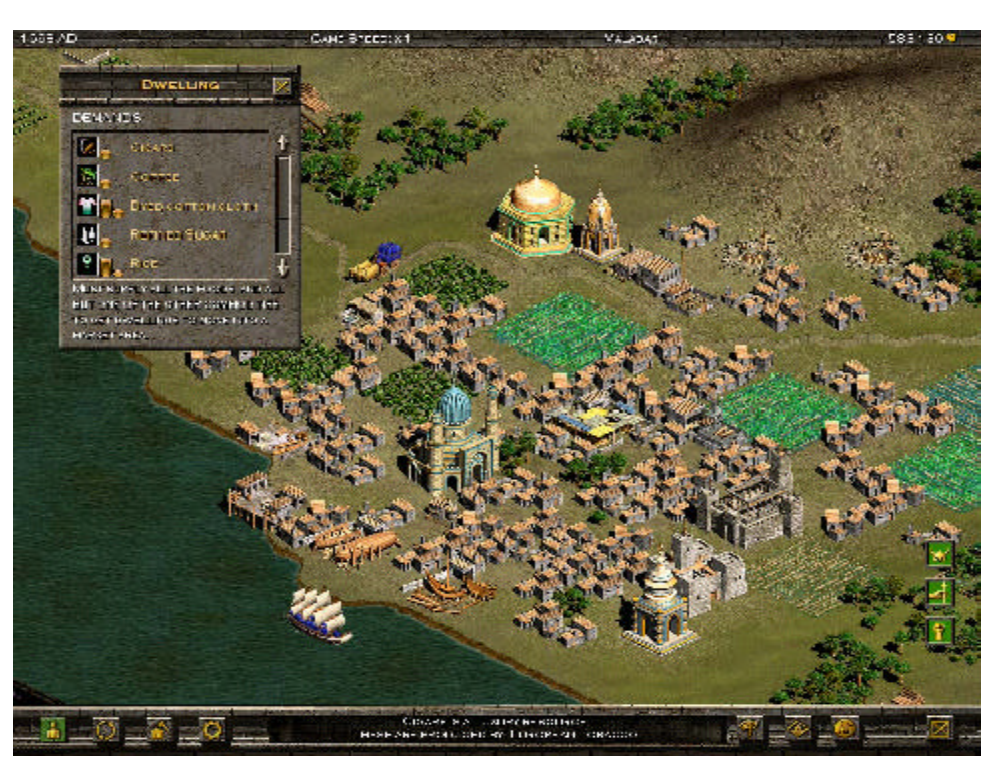
"I don't know what rice is, I just know its price." "Trade Empires" interface guides players' quest for personal wealth.

made is that we see that some goods will go to waste, simply because there is no demand even at half off the original price. In fairness to Eidos Interactive, the difference between a sale price and total waste is merely a question of proportions. Wasting more goods may result in higher prices for the remaining goods after all.