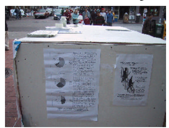
Getting the word out in Berkeley.

criminal and deserves to suffer. The other one said to him "hey, my dad's in prison" and eagerly signed the petition proclaiming how much he would hate to be locked in the SHU. He then convinced his friend to sign as well. At the rate imprisonment is rising in the U.$., the number of people who have been or know someone in prison is reaching far into the population. And this provides a significant base of