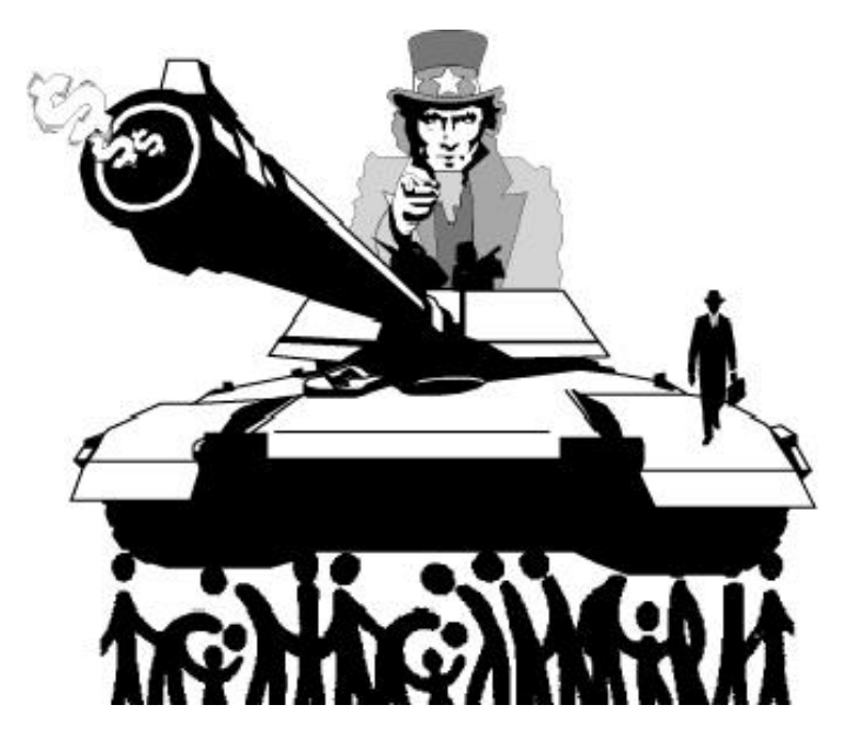
El militarism amerikano trae muerte y la destrucción a la gente del mundo.

Los norteamericanos deberían hacer mucho caso de lo que están diciendo sus ex-amigos en la Corea del Sur. No debería haber ninguna razón para que los coreanos sospechen una intervención con fines lucrativos en sus asuntos por parte de Bush, aunque lo más probable es que sus sospechas tengan razón. Es bastante difícil llevarse bien tal como