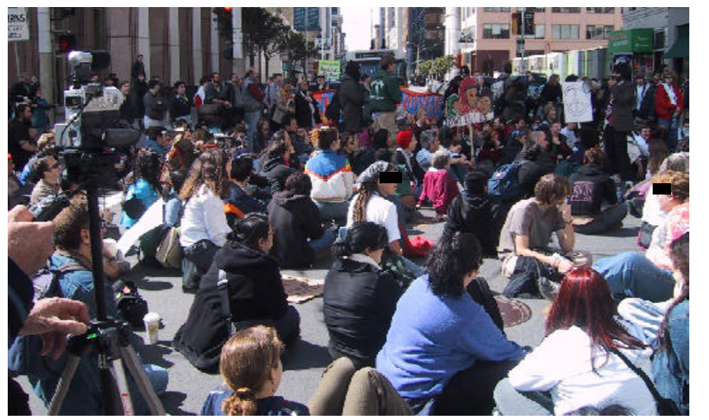
San Francisco protestors: No business as usual March 15.

6. http://www.nytimes.com/2003/03/ 04/international/middleeast/04ASSE.html