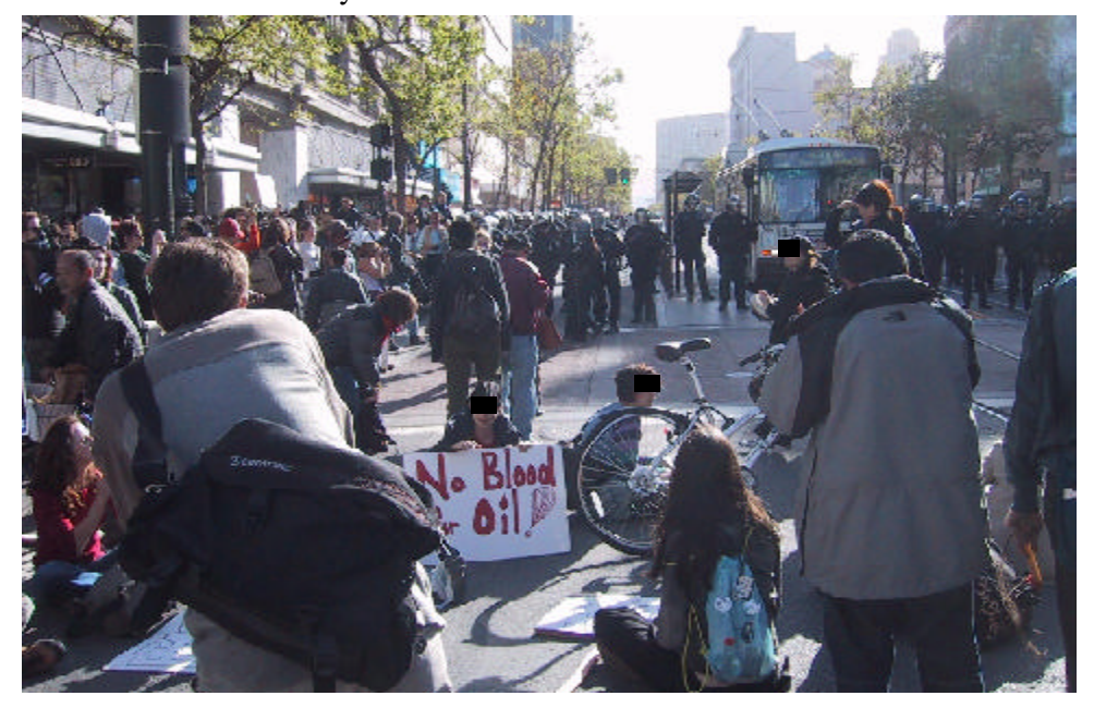
San Francisco protestors blocked streets March 15.