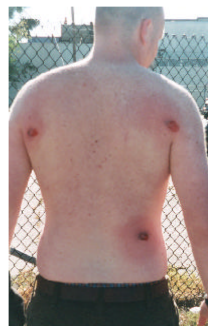
Police shot rubber pellets at protesters, resulting in painful welts.

chant. While this is a true statement it is misleading to tell people that workers in this country are going to stand up against war.