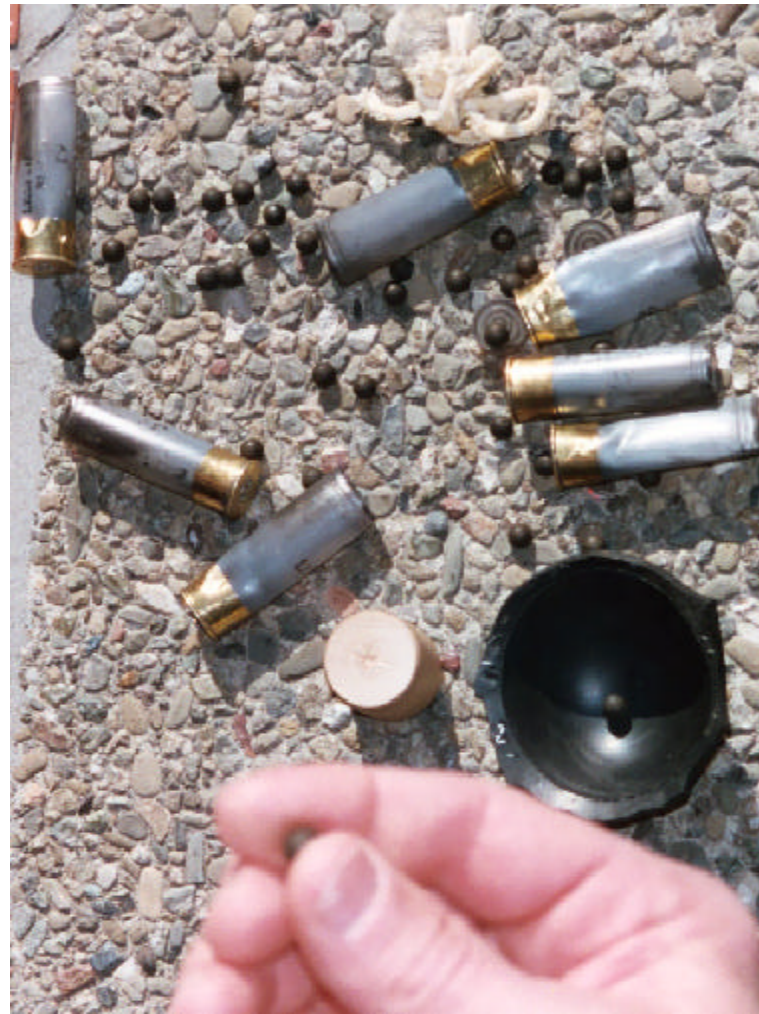
Protesters filed complaints with police (left) after being hit with an array of the latest in "less-than-lethal" weaponry (right).

The demo was successful in stopping the morning shift of workers, and word on the street was that there was no one to unload the docks as of 8 a.m. Once the traffic did open up outside of APL the line of trucks was shorter than expected. Apparently many workers didn't come to work today, while others were sent home. Surely they were happy to get a day off with pay.