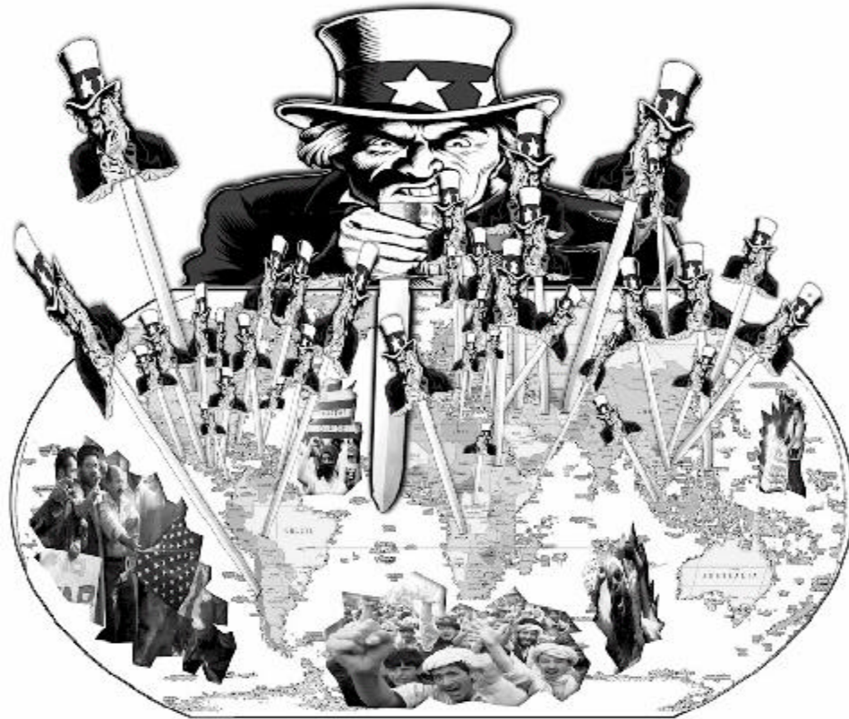
The graphic shows countries invaded by U$ imperialism. For a poster version that lists the countries, go to: http://www.etext.org/Politics/MIM/art/invasionmap.html .