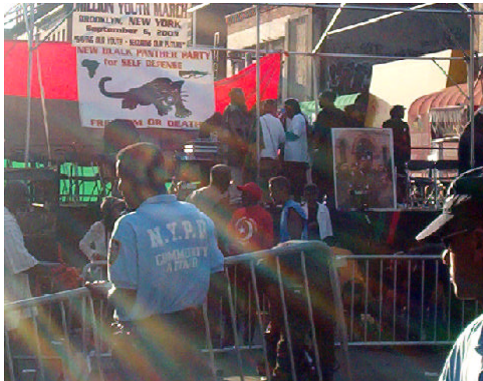
Black Panther imagery at the march

Chants of "Black Power!" filled the air this sunny afternoon and Black Panther Party imagery surrounded the speakers on their platform at the "Million Youth March." MIM handed out 500 copies of MIM Notes 287.