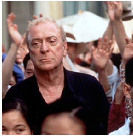
Michael Caine in The Quiet American .