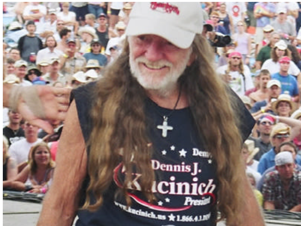
Willie Nelson supports Kucinich.

As MIM has explained at length, the majority of the workers in this country are benefiting from the exploitation of workers around the world. Giving them a bigger piece of the imperialist pie is just shifting around the superprofits. These workers are not creating the wealth they are sharing in and this parasitism needs to be eliminated along with the capitalists who perpetuate it. (See MIM Theory 1