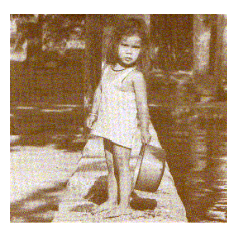
Widespread hunger and transcontinental slavery are two of "democracy's" accomplishments

of believing the majority rule of their facts but do not draw the same not working in practice, but they downplay conclusions. They know "democracy" is the problem or try to reform the system.