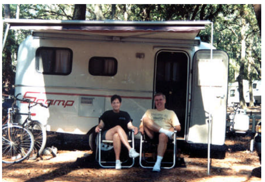
Tough times for Amerika.

We should head off a few counterarguments and clear up a few problems with the data. First, this being U.$. Census data, we don't get to choose the categories. So, "Whites" here includes some people classified as "Hispanic" (which we call "Latino" on the table). In practice that just means the results for Whites are really a little better than we see here. And, "Black" households include a small number of immigrants who are "black" by "race" but not necessarily yet members of the Black nation in the U$A. Finally, the group we call "Latino" here includes people from many nationalities, from more poor populations like Mexicans to richer groups like Cubans, and we can't differentiate them here.