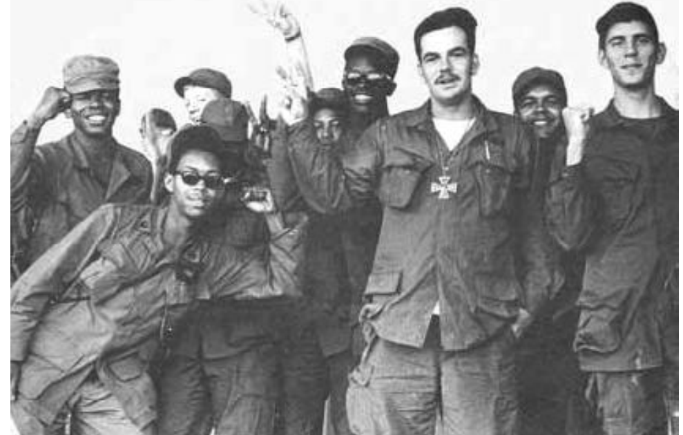
In Vietnam, U.$. soldiers killed hundreds or thousands of their own commanding officers.

You are not on a mailing list. You will not receive this paper again unless you take action. PRESORTED STANDARD U.S. POSTAGE PAID PERMIT #56365 BOSTON.MA