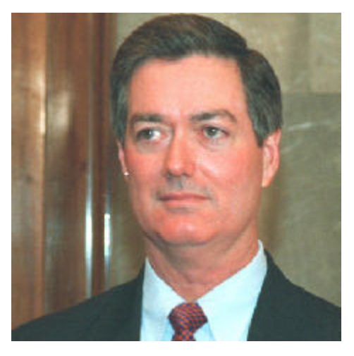
By HC116 Posted on mimnotes.info June 30, 2005

COLORADO GOV. BILL OWENS ATTACKS CHURCHILL--AGAIN