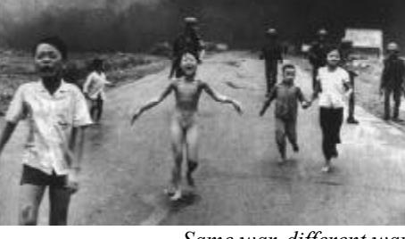
Same war, different war.

Now, the United is defending itself by saying that the phosphorous was used to illuminate enemy fighters night, at