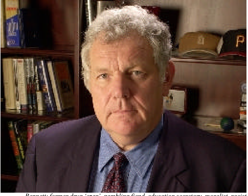
Bennett: former drug 'czar', gambling fiend, education secretary, moralist, racist

So, not only do Blacks have a higher poverty rate than whites (using the unscientific U.S. government definition's of "poverty"), poor Blacks often face harsher conditions than poor whites. Being Black or not is a relevant social variable in some contexts, and there is nothing racist or racial about pointing this out. In fact, it is an indictment of national oppression to talk about the ways that rates for different kinds of crime are shaped by national oppression. Some white people don't have to steal things on the street because they have jobs where they sit in an office stealing wealth from Third World workers, or jobs in which they put the finishing touches on products made by oppressed-nation migrants and take a cut of the profit. This doesn't just have to do with skin color or even perceptions of