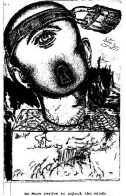
We Must strive to unlock the minds of the people by revealing the truth

Knowing the world and conditions inside the belly of the beast is key. Equip yourself with mimnotes.info and write for mimnotes.info.