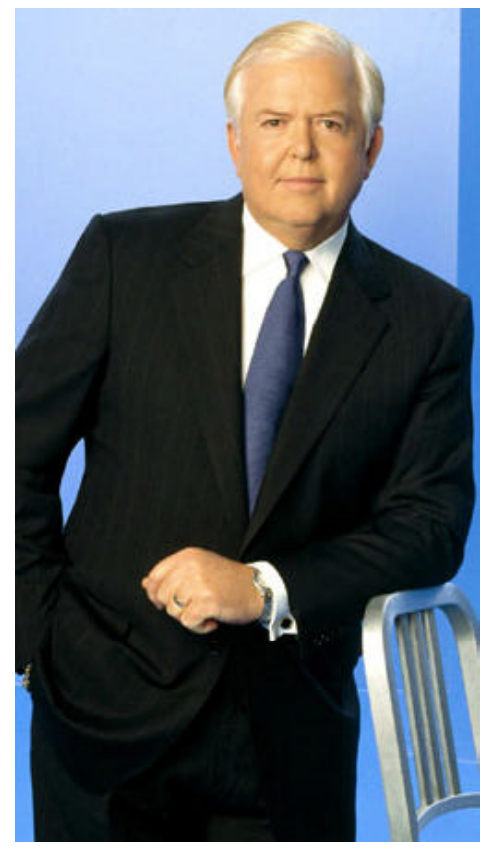
Dobbs: Someone should steal his job.

Instead of relating unemployment and educational attainment to imperialist interference in the self-determination of Latino nations inside U.$. borders, Romans described the lower high school graduation rate of Latinos as a problem for Amerika as a whole, a political problem. "[T]here are fundamental problems in this country that are eating away the foundations of America and the numbers don't lie." Romans also gave a figure for government-defined poverty. Portraying unwed wimmin and female youth as a threat to the "national interest," Romans reported: "today the government announced a record 1.5 million babies born to unwed mothers last year." CNN had several so-called experts talk about how these and similar numbers supposedly reflected a danger to Amerikans in general, oppressors and oppressed alike.