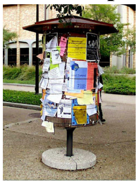
WHICH GETS YOUR GOAT? The eyesore is in the eye of the beholder (the beholder's class, that is).

"SEC. 184.65. IDENTIFICATION OF PERSONS RESPONSIBLE FOR POSTING OF SIGNS. In any civil action seeking recovery of a civil penalty and/ or costs of removal of a Sign for violation of any of the provisions of this Article proof that the Sign posted contains the name of or in any other manner identifies a Person shall give rise to a rebuttable presumption that the Person caused such