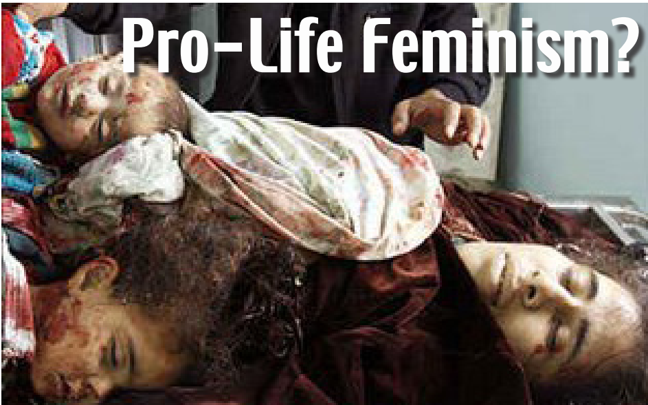
Dead Palestinian mother with children