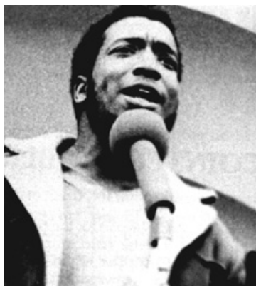
Black Panther Fred Hampton was murdered by the FBI after creating the first Rainbow Coalition in Chicago around revolutionary anti-imperialist politics

For more info on MIM(Prisons) and our relation to the greater Maoist movement, write to us for a copy of "Maoism Around Us."