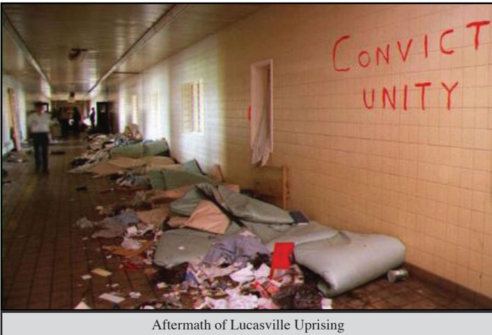
Aftermath of Lucasville Uprising